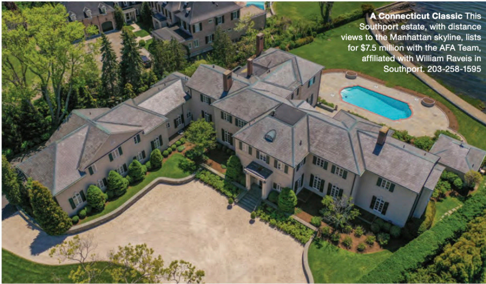
A Connecticut Classic This Southport estate, with distance views to the Manhattan skyline, lists for $7.5 million with the AFA Team, affiliated with William Raveis in Southport. 203-258-1595